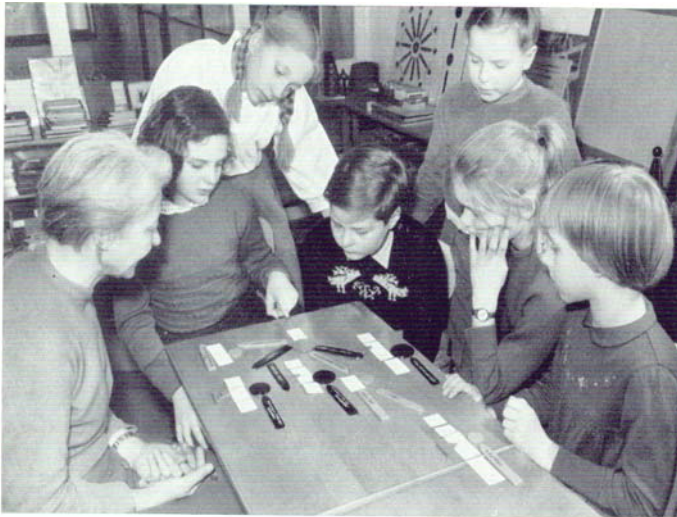
Montessori school in Frankfurt, 1956