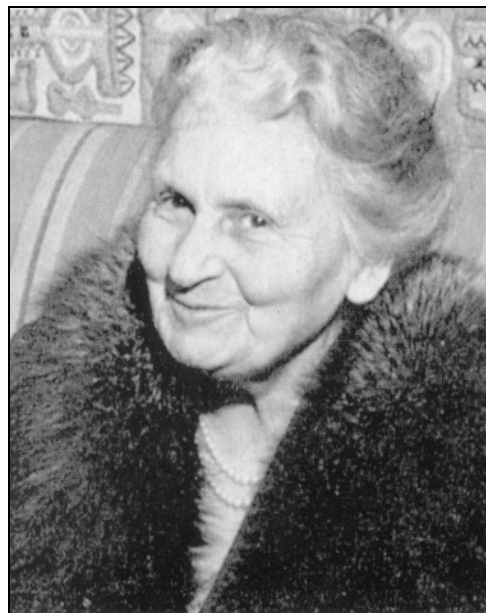
Dr. med. Maria Montessori, 1870 - 1952

A survey of the tasks of the academic Montessori Centre of the University of Muenster and of the facilities it offers